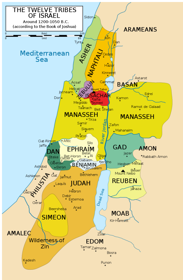
Note Locations of Ephraim, Jordan and Moab

And he said to them, " Pursue (imperative - command) them , for the LORD has given (Lxx - paradidomi ) your enemies the Moabites into your hands - Ehud encouraged the sons of Israel that the victory was guaranteed because the Lord had given the Moabites into their hands. As explained earlier to "give into the hand of" is an idiom which means "to deliver over to the power of," and in essence "to enable to conquer."